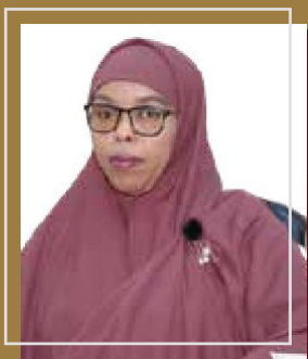
Deqa Hassan Hussein

Deeqa Hassan Hussein, from Somaliland, was a senator in the 10th and 11th Somali parliament.