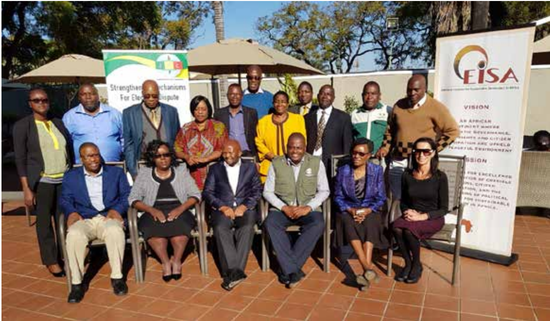
ZEC and EISA personnel training in conflict management

for ADR efforts was the technical support provided for the launch of the national MPLC as well as its sittings. EISA also provided expertise to the national and 21 provincial MPLC sittings in nine provinces, which were attended by representatives of presidential candidates, members of Parliament and local councillor candidates and the ZRP.