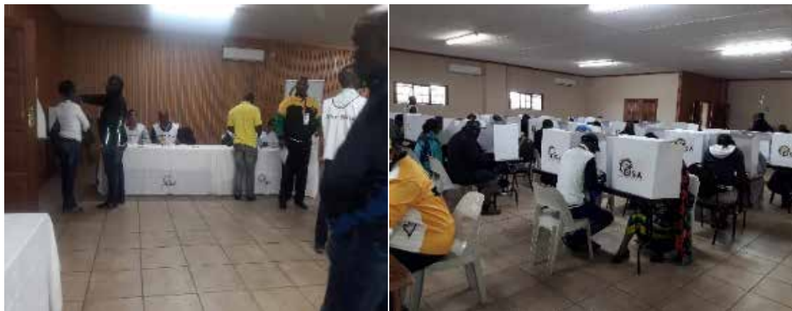
Voting under way at the ANC Limpopo provincial list conference

Working closely with the KwaZulu-Natal and Limpopo provincial list committees and the national list committee, EISA captured nomination forms received from branches, prepared a list of qualifying candidates for each province and presented a draft candidate list to the national list committee. In addition, EISA was tasked with capturing data received from all nine provinces for the national candidate list. The KwaZulu-Natal and Limpopo list conferences were held in December 2018 and the national list conference will be held in the next reporting period.