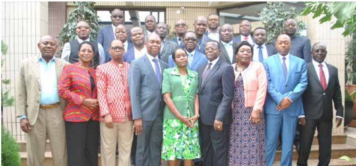
Workshop with EMBs and CSOs for peaceful and transparent elections. Brazzaville (Republic of Congo), 24 and 25th October 2018.