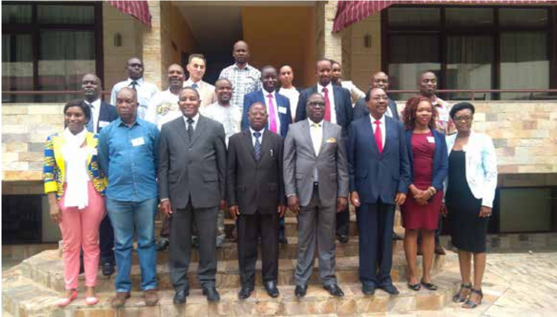
Participants at ICGLR Thematic Workshop in Bujumbura

As part of its efforts to strengthen the ICGLR's election observation methodology EISA facilitated the endorsement of the Declaration of Principles (DoP) for International Election Observation. ICGLR's endorsement of the DoP will expose it to the wider community of practice on election observation and promote peer learning within the community to further strengthen the methodology.