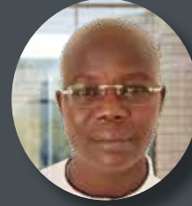
BAIDESSOU SOUKOLGUE ELECTORAL EXPERT (INTERNATIONAL)