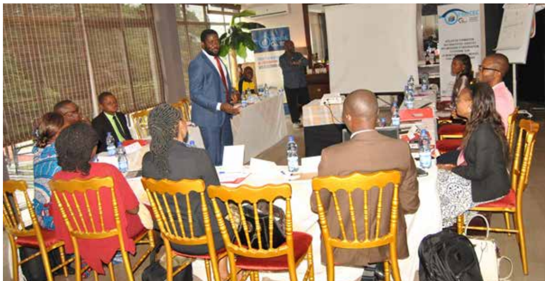
Workshop on legal analysis, Kinshasa, 2-4 May 2018