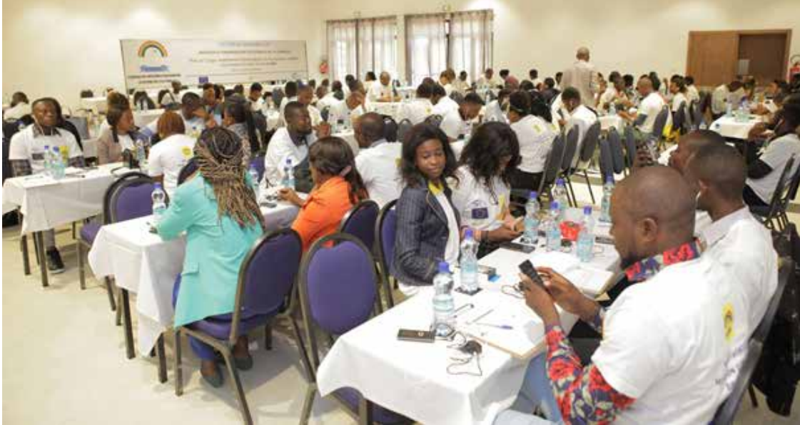
A view of the call centre