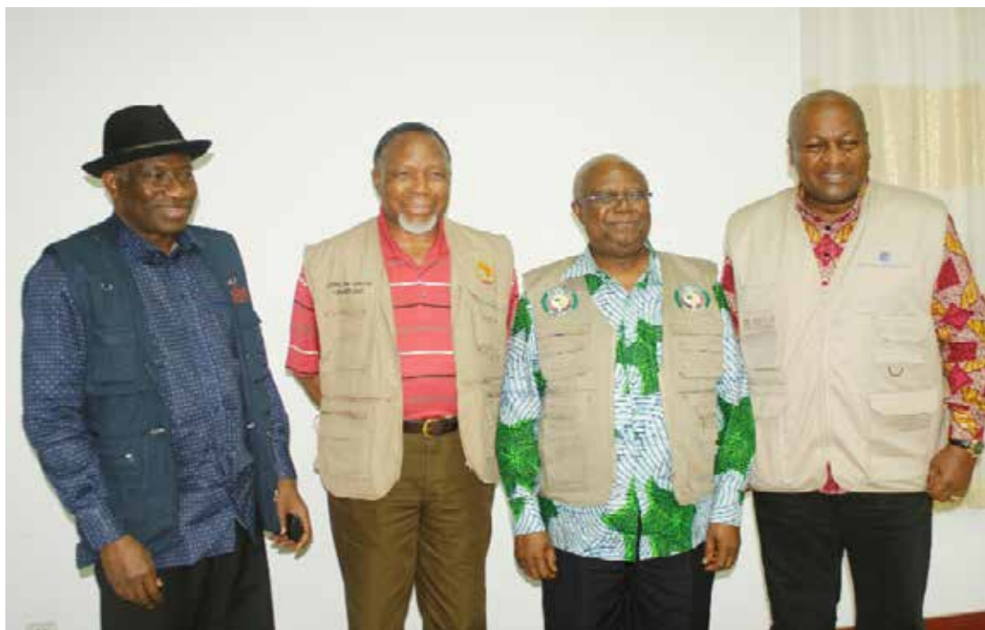
His Excellency, Dr. Goodluck Jonathan, Leader of EISA EOM with His Excellency Kgalema Motlanthe (Head of AU EOM), His Excellency, Prof. Amos Sawyer (Head of ECOWAS EOM) and His Excellency, John Mahama (Head of Commonwealth Observer Group)