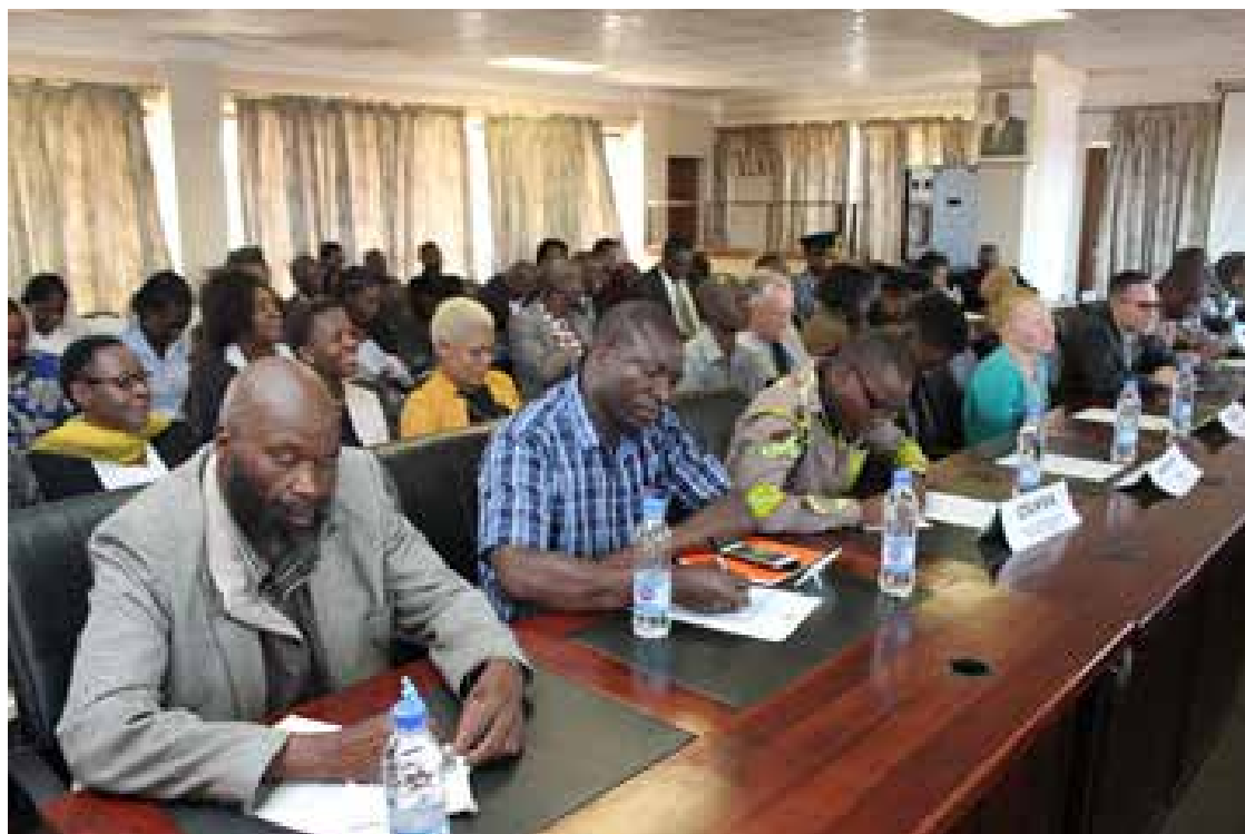
ZEC-CSOs-FBOs consultative meeting

Building on EISA's support for the ZEC-political-parties dialogue platform in 2017, EISA provided technical help at meetings held on 28 March and 8 May 2018. During these meetings the parties were briefed on the framework of the data consolidation and voters' roll compilation processes after registration, the upcoming voters' roll inspection exercise as well as a provisional election roadmap. Political parties also used these meetings to make inputs into the process and raise concerns with the ZEC, where applicable. The meetings provided an opportunity to discuss election-related issues, for instance, political parties were apprehensive about the printing of ballot papers and requested that the ZEC be transparent about the procurement processes.