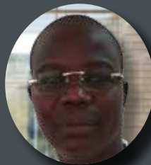
BAIDESSOU SOUKOLGUE ELECTIONS AND POLITICAL TRANSITIONS SPECIALIST