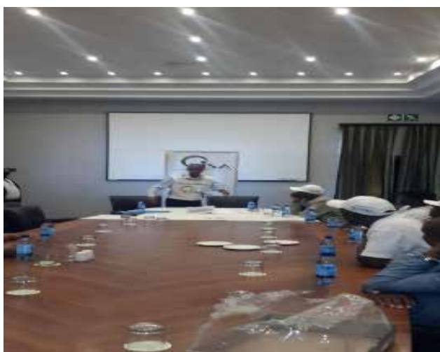
The EISA presiding officer briefing SANTACO observers

SANTACO elected nine national office bearers at its eighth national congress, held in Boksburg on 18 April 2018. The congress was attended by 688 voting delegates, representing all nine provinces. EISA was requested to receive nomination forms at the SANTACO offices and to verify the forms in the presence of observers at the congress. All candidates were elected unopposed and the EISA presiding officer announced the election results at a gala dinner at the congress.