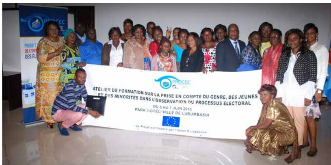
Participants in the workshop held in Lubumbashi from 5-7 June 2018

Workshops were organised in Lubumbashi from 5-7 June, in Kinshasa from 19-21 June and in Kisangani from 4-6 July 2018, on mainstreaming gender, youth and minorities in the electoral process. The workshops contributed to better understanding by citizen observers of marginalised groups and ways of advocating for better integration of women, youth and minorities in the conduct of national affairs. Women were well represented among the participants, numbering 44 of the 66 people who attended. The workshops were facilitated by three CSO representatives, supported by staff from EISA's Madagascar and head offices.