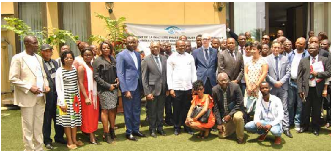
Several dignitaries were among the audience that attended the launch of PROCEC II in Kinshasa