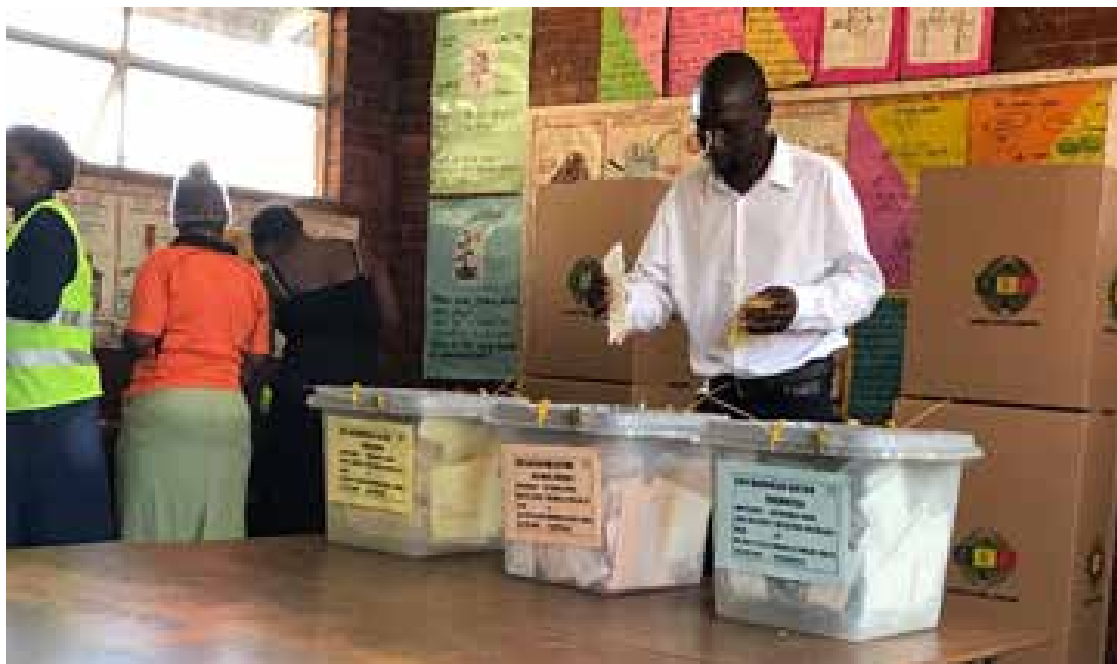
Casting a vote in the 2018 elections