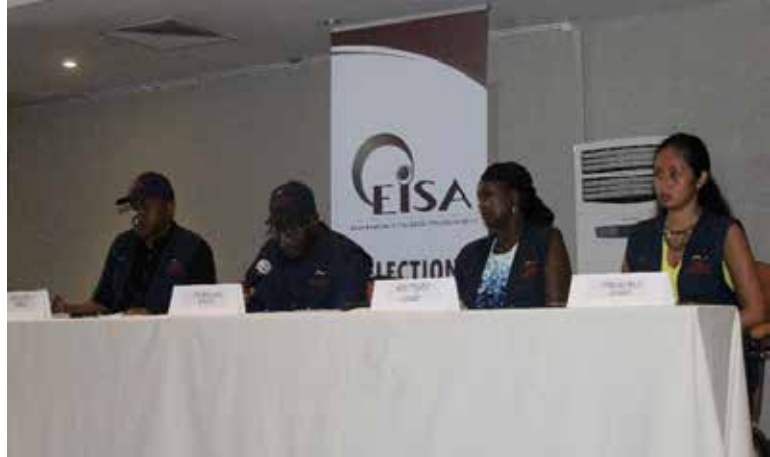
Press Conference of the EISA EOM to Sierra Leone

An EISA EOM was deployed to the 2018 general elections in Sierra Leone held on 7 March 2018 and a TAM was deployed to assess the run-off presidential election held on 31 March. The EOM, comprised of 12 observers, was deployed from 26 February to 11 March, while the TAM, comprised of four technical experts, was deployed from 21 March to 3 April 2018. Both missions were led by His Excellency Dr Goodluck Jonathan, former Nigerian president. Because of the keenly contested election in Sierra Leone EISA included a high-profile mission leader in its technical assessment team. The leadership of the EISA TAM made a valuable contribution to the efforts by international EOMs to mitigate the conflict between the two contending parties and the National Electoral Commission. Due to the limited election-day coverage of the TAM a public statement was not issued. The statements and reports of the EISA EOM are available on its website: https://eisa.org.za/epp-sierra.php .