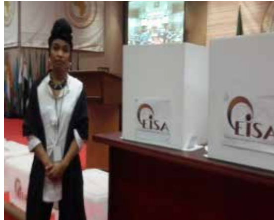
EISA official at the Pan African Parliament elections 2018

As part of its ongoing partnership with the PAP, EISA provided technical support and observed the conduct of PAP's elections held in Midrand in May 2018, where it elected a president and first, second and third vice-presidents.