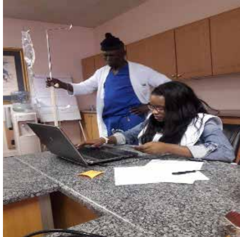
The EISA voting site for special votes at the Impala mine hospital