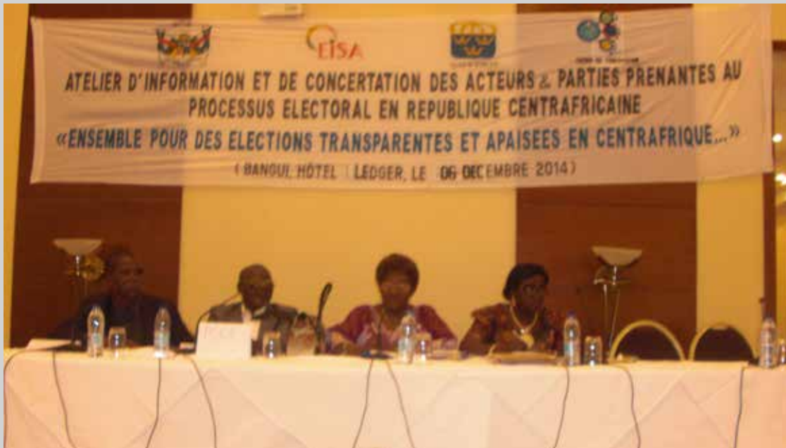
A PANEL DISCUSSION DURING THE MEETING OF THE CADRE DE CONCERTATION, SUPPORTED BY EISA. HOTEL LEDGER, BANGUI, CAR, 6 DECEMBER 2014.