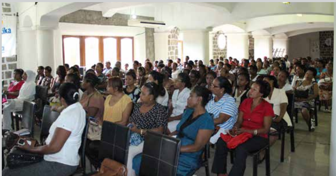
WOMEN AT LOCAL LEVEL SENSITISED TO THEIR HUMAN AND DEMOCRATIC RIGHTS, ANTSIRANANA, JUNE 2014

A lack of coordination and cooperation among actors in the gender field is one of the factors that has hampered the achievement of gender equality in Madagascar. Despite the large number of organisations involved in promoting gender parity, this has impeded the development of a cross-cutting strategy that could improve the situation.