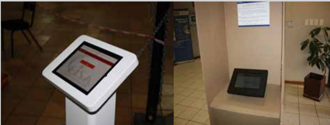
THE EISA KIOSKS PRESENTING THE E-BALLOT SYSTEM