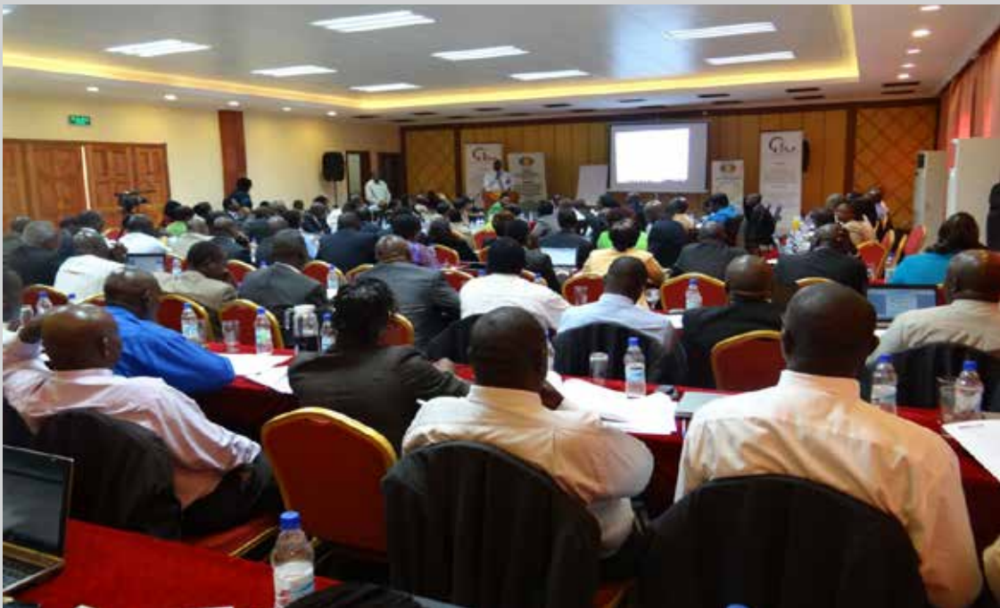
ZEC PERSONNEL AT THE FIVE-YEAR STRATEGIC PLAN REVIEW WORKSHOP

EISA supported the ZEC in convening a workshop from 2-8 March 2014 to take stock of the progress made in implementing its five-year strategic plan. During this workshop, the ZEC made adjustments to the strategic document in line with its expanded constitutional