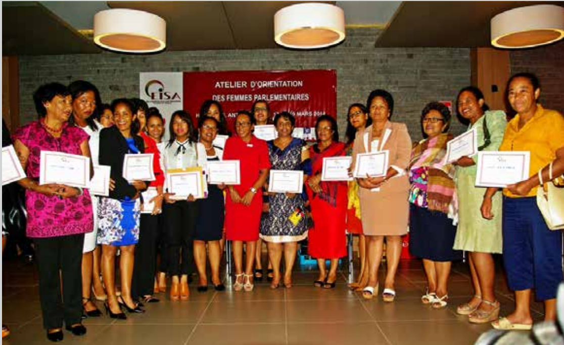
FIRST SESSION OF ORIENTATION TRAINING FOR WOMEN MPS, ANTANANARIVO, MARCH 2014

MPs with the tools and competencies required to successfully perform their mandates. EISA contributed to achieving the National Assembly Strategic Plan, which is aimed at the emergence of a stronger and more effective institution.