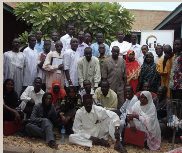
Regional workshop with political parties. Abeche (North East)- 16 and 17 Oct 2012