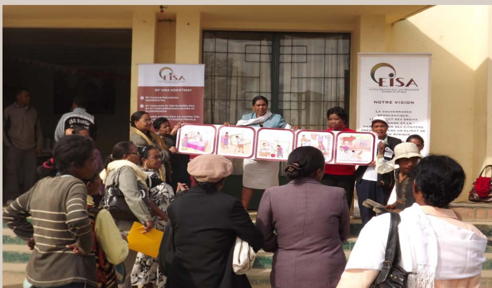
VMLF members trained on the use of the pagivoltes

EISA trained 32 facilitators in the use of the pagivolte in a workshop held in Antananarivo. These facilitators are now able to use this tool alongside the other training material that they use. The use of pictorial imagery, namely pagivoltes, and conducting the course in and printing material in the Malagasy language has proved extremely successful at community level.