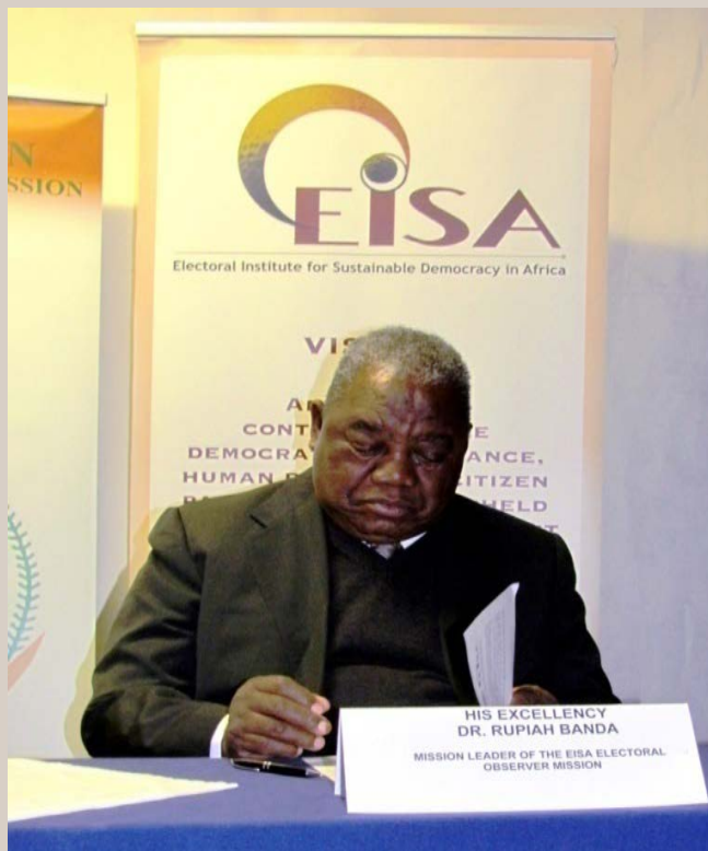
His Excellency, Rupiah Banda, Former President of the Republic of Zambia and Leader of the EISA EOM to Lesotho

As part of its support to the AU, EISA was requested to develop an Election Observation Manual to be used by all AU observers. The first draft of the Manual was submitted in the last quarter of the year.