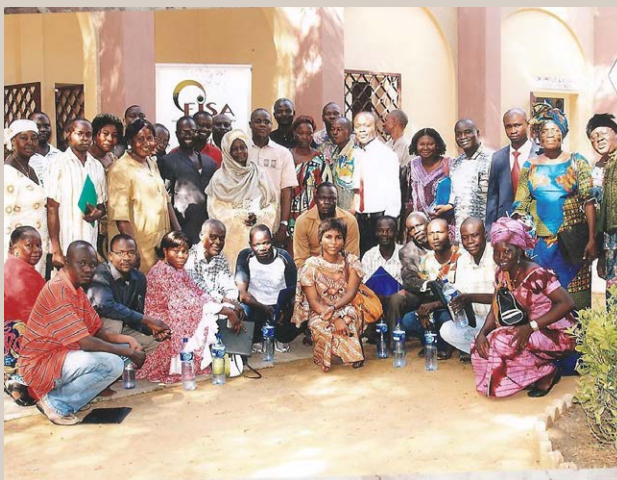
Workshop on International elections observation with CSOs- N'Djamena, 21 and 22 Sept 2012