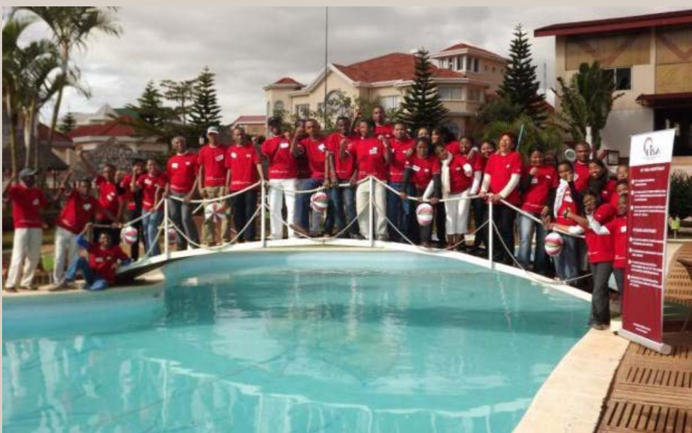
Members of the Association of Intellectuals for the Promotion of Gender issues during the capacity building workshop at Hotel Les Hérons 20-23 June 2012

Other activities undertaken included a meeting held on 22 November 2012 in Toamasina with members of the Intellectuals’ Association for Gender Promotion in the Toamasina province. This was meant to monitor the level of implementation of gender sensitization activities by Toamasina University students. One finding that came out of the interaction between EISA and the group was that the campaign has significantly contributed to the personal growth of the students involved in the project. Through the campaign, most of the students who reached out seemed to be more cognisant of the need to promote gender equality at university level although engaging with female Muslim students proved to be challenging. Most of these students refused to accept the notion that the only difference between men and women is merely biological and that both men and women should have equal social roles, rights, and responsibilities. Obviously, more specific action is needed to reach out to the Muslim