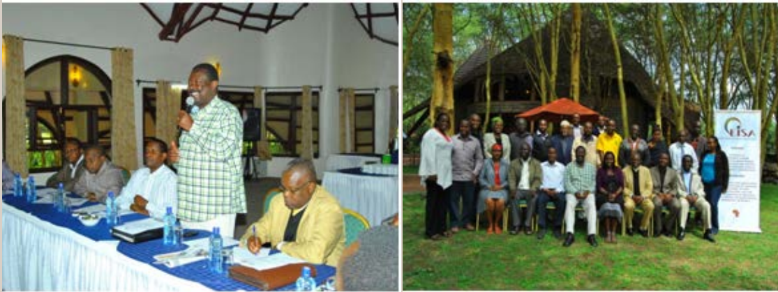
8th – 10th July 2012, Sopa Lodge, Naivasha: Strategy and policy development workshop for the United Democratic Forum (UDF). Left honourable Musalia Mudavadi UDF party leader addressing participants during the workshop and right a group photo of the participants

processes and offences as well as their role in the electoral process. A critical component of the training was to explore the maintenance of peace and security within the context of elections.