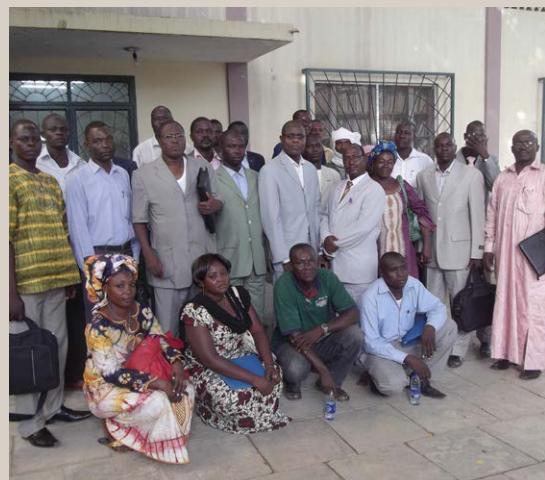
Workshop on Party coalitions, intra and inter party conflicts- N'Djamena, 12 Oct 2012