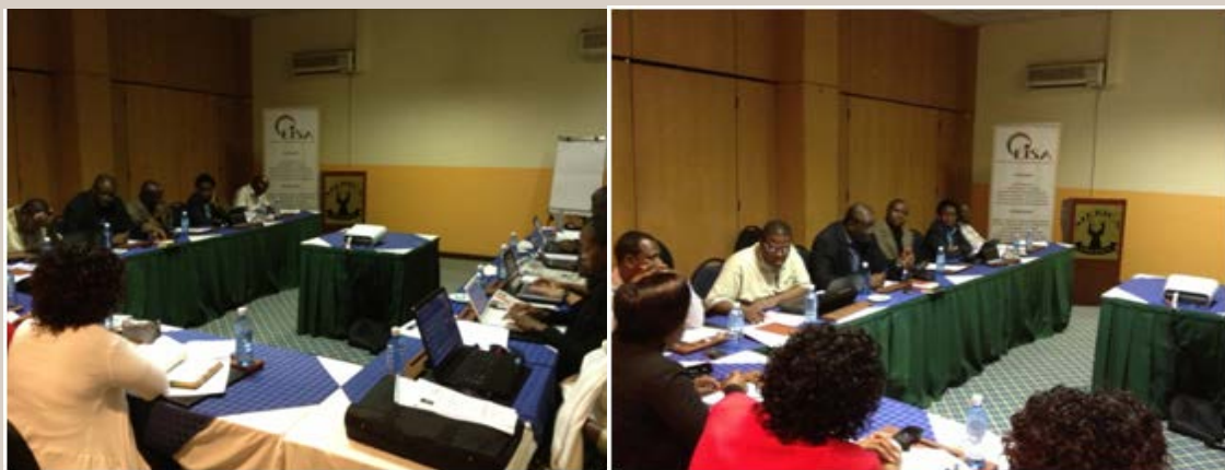
9th – 11th August 2012, Enashipai Lodge, Naivasha, development of action plan for the political parties dispute tribunal. Participants following discussions during the meeting

EISA-Kenya launched the Handbook on Kenya's Electoral Laws and System, developed by EISA in the preceding year, on 19th September 2012. Among the participants to the launch were the main electoral sector players in the country, the British High Commissioner and the Head of SIDA, Kenya. Development of the book was termed as timely as it provided an invaluable one-stop reference to the electoral reforms undertaken in Kenya. It also provided an overview of the electoral system in Kenya and the structure of the functions of the key organ