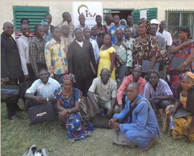
Regional workshop with political parties. Moundou (South)- 13 and 14 Nov 2012

A workshop for parliamentary staff held on the 20th and 21st April 2012 was attended by 57 participants and included the technical staff of the National Assembly as well as those who provide administrative and support services. In qualitative terms, this second training session enhanced the knowledge and experience of the selected parliamentary staff in topical issues such as parliamentary procedure, public relations, dealing with the media, and report writing.