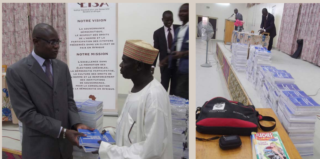
Presentation of EISA's Political parties' training manual. N'Djamena, 7 Nov 2012

Two training sessions were organised by EISA-Chad on parliamentary oversight during the